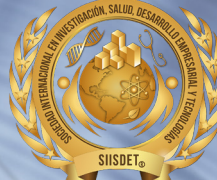
Society for Research and Health Sciences