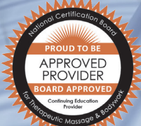
Therapeutic Massage and Bodywork