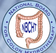
Approved Program Continuing Education