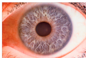
Weak Genetic Constitution